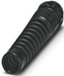
Cable gland, Cable gland material: Polyamide, Application: Standard, External cable diameter 9 mm ... 17 mm, Shielding: No, Connecting thread: M25

Please be informed that the data shown in this PDF Document is generated from our Online Catalog. Please find the complete data in the user's documentation. Our General Terms of Use for Downloads are valid ( http://phoenixcontact.com/download )